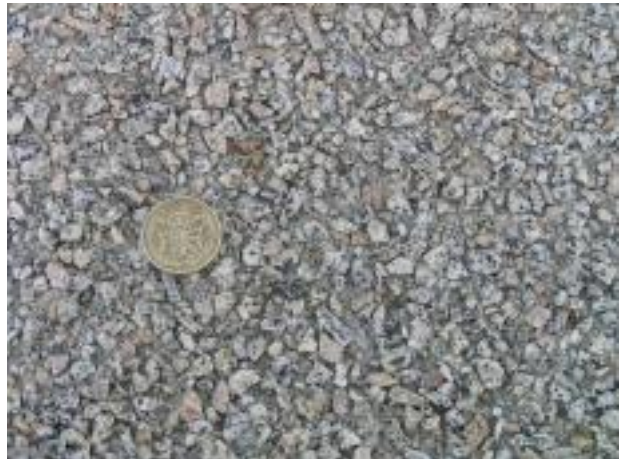
Exposed Aggregate Granite Finish

Exposed aggregate concrete is manufactured by placing concrete in a mould and then removing the cement paste from the surface revealing a decorative aggregate.