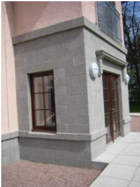
Exposed Aggregate Granite Finish