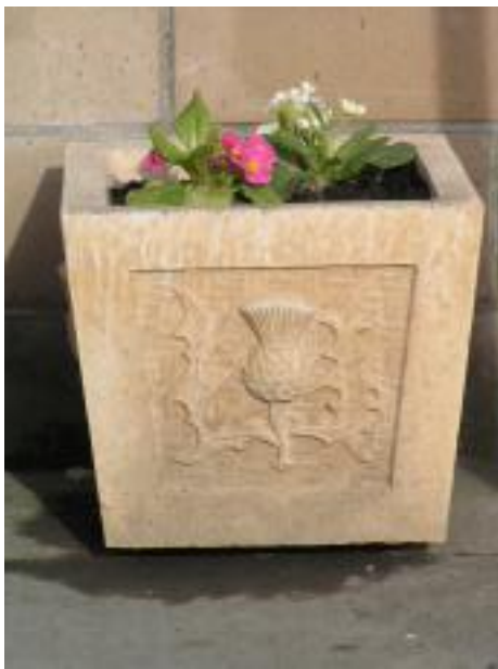
Planter Garden Ornaments