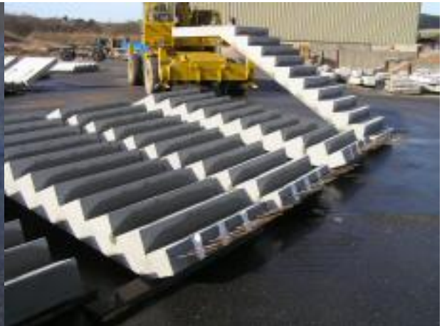
Stairflights / Landings