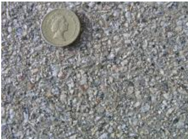
Exposed Aggregate Granite Finish

Exposed aggregate concrete is manufactured by placing concrete in a mould and then removing the cement paste from the surface revealing a decorative aggregate.