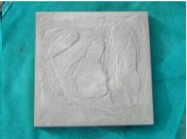
Riven Face Slab