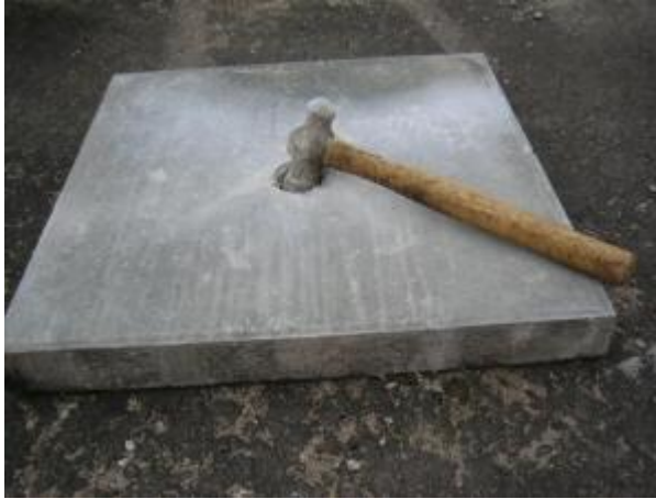
Fibre Reinforced Slabs