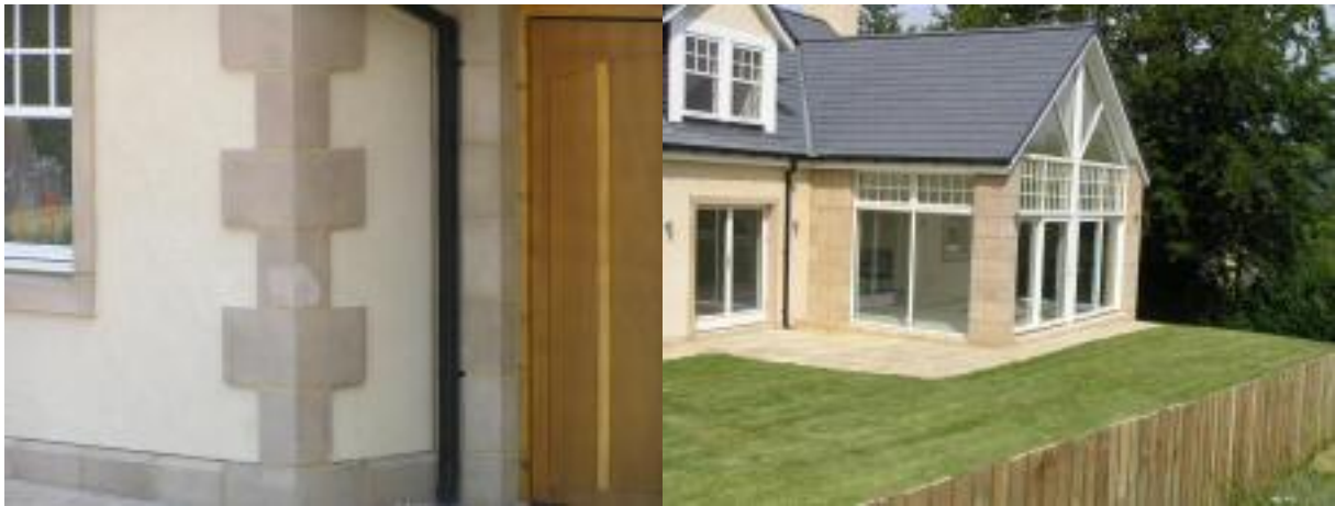
Cast Stone Quoin Blocks

Cast Stone use of cement and aggregate makes it an appropriate and attractive product for use in new build and refurbishment projects. It is durable and can match the appearance of many natural stone finishes.