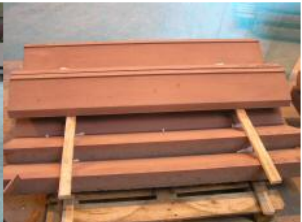
Cast Stone Sill Montrose