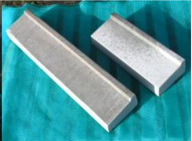
Kit Sill (Stock)