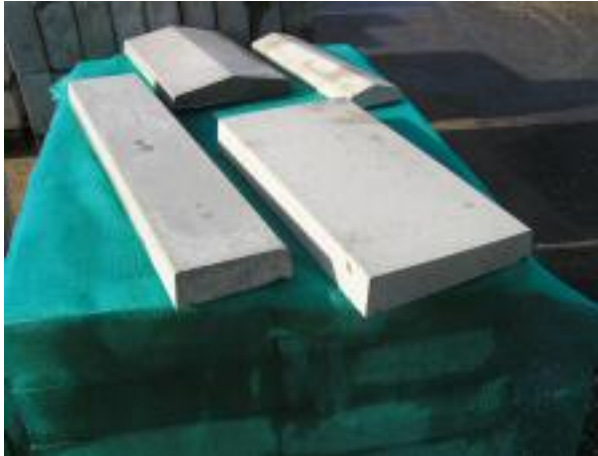
Single Splay and Double Splay Cope