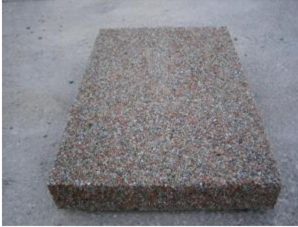
Exposed Aggregate Lochton