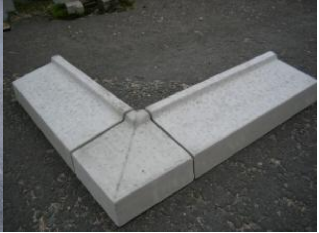
Stock Kit Sill Lochton