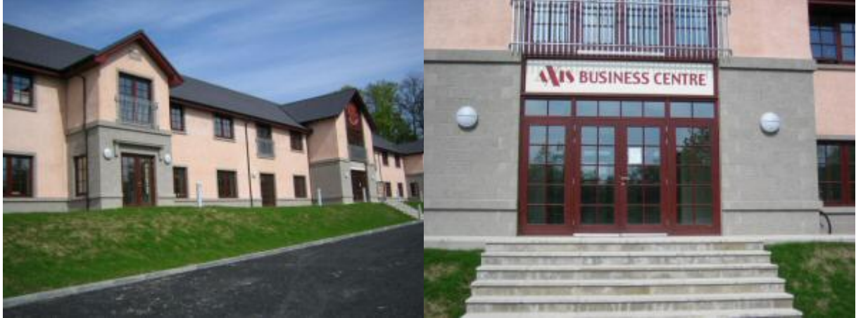
Exposed Aggregate Granite Finish