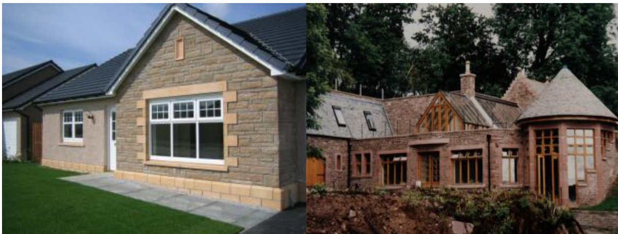
Montrose Cast Stone

Cast Stone is comparable to natural stone as a building material in appearance and performance. It can be formed to almost any shape and size.