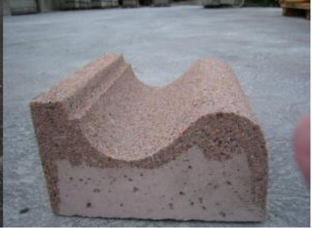
Corrennie Red Exposed Aggregate Finish Lochton