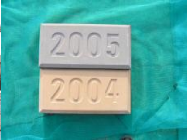
Montrose Cast Stone Date Stones