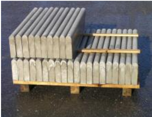
Bull Nose Garden Edging