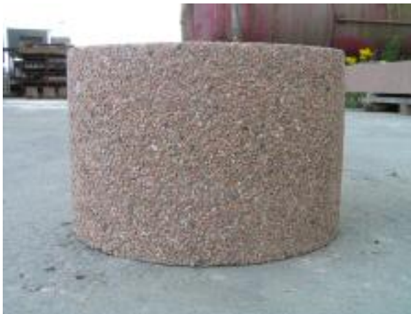
Half Column Block Exposed Aggregate Finish Corrennie Red Lochton