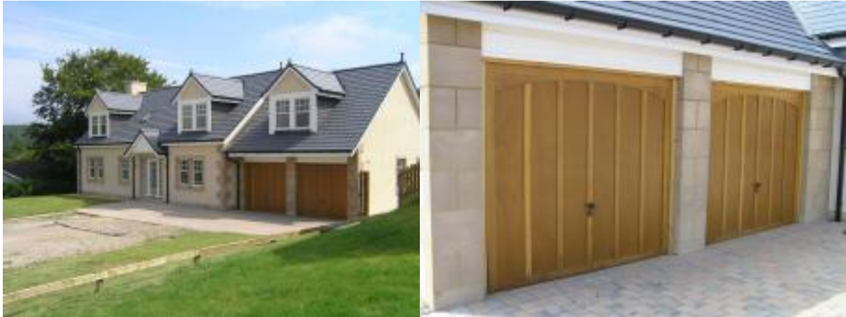
Montrose Cast Stone Blocks

Cast Stone use of cement and aggregate makes it an appropriate and attractive product for use in new build and refurbishment projects. It is durable and can match the appearance of many natural stone finishes.