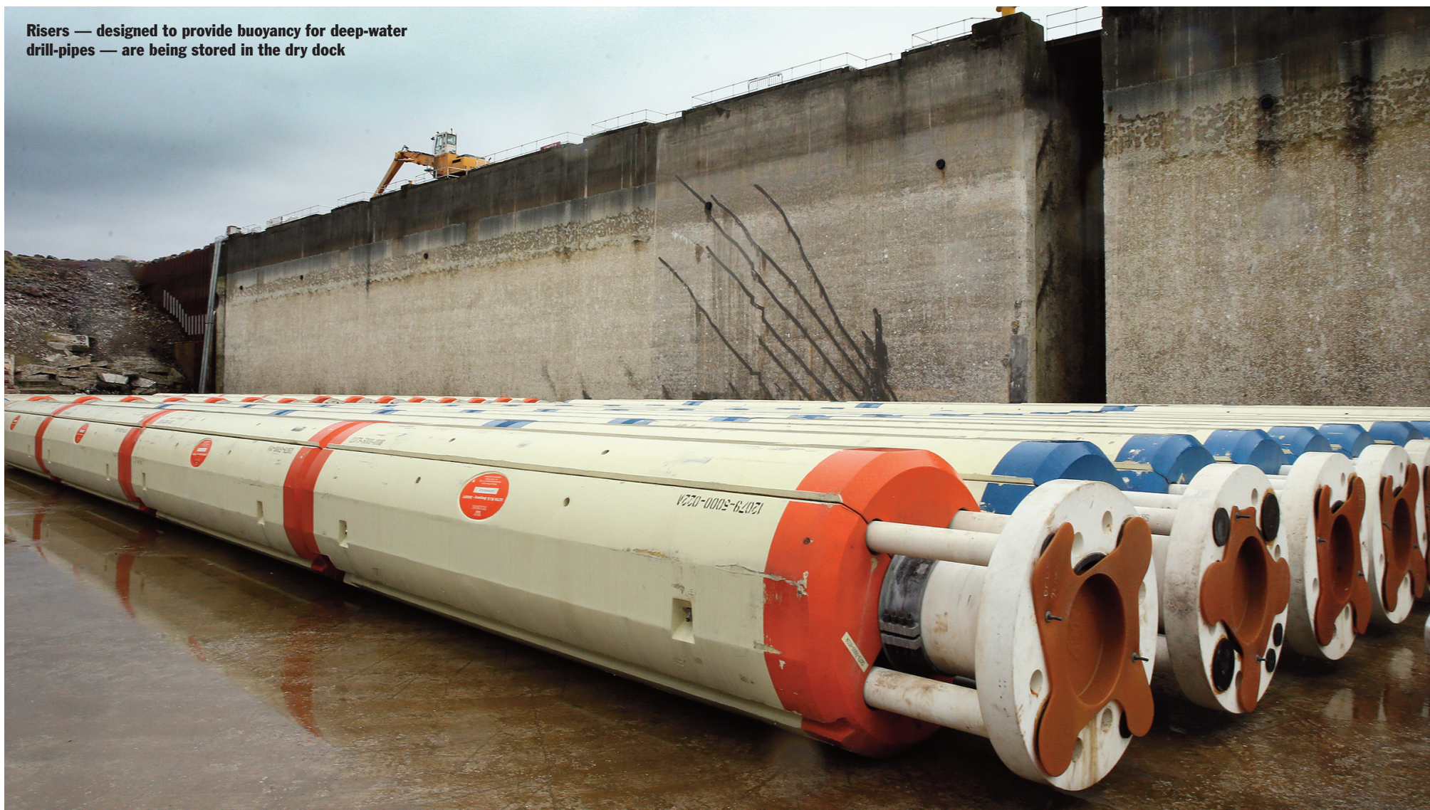
Risers — designed to provide buoyancy for deep-water drill-pipes — are being stored in the dry dock