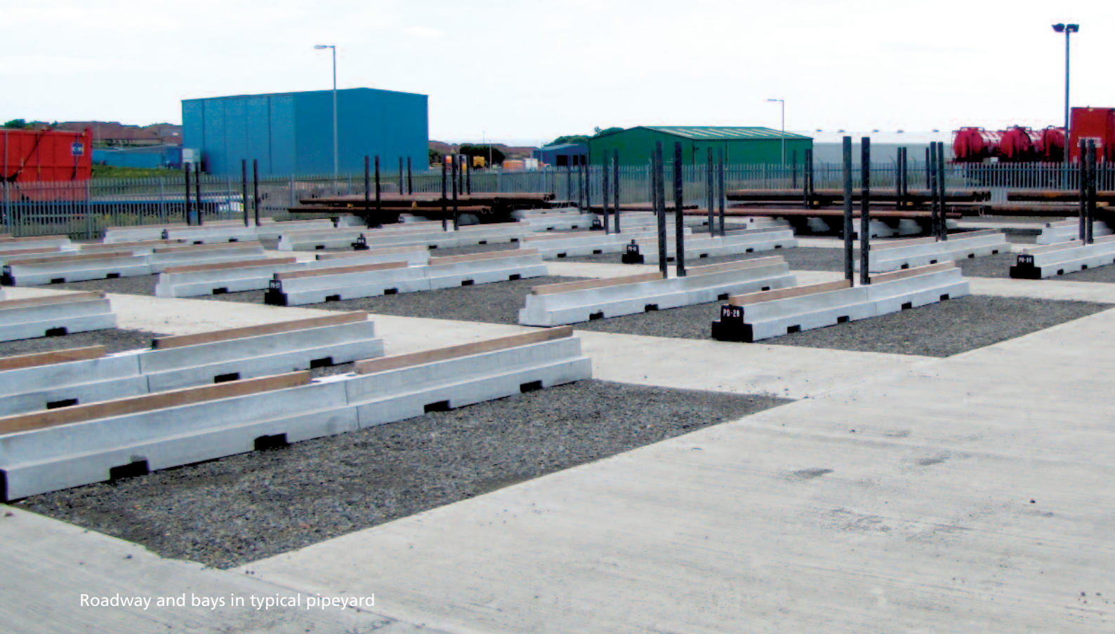
Roadway and bays in typical pipeyard

Concrete supports for storing and handling large oilfield or commercial pipes. These concrete supports have been designed to permit pipes to be stored in a controlled manner in a location where vehicles can access for delivery and collection. Pipes can be racked in a particular manner and can be unloaded and loaded by fork lift to minimise manual handling. Vertical supports can be placed in the racks to hold a certain number of pipes which can then be loaded directly to transport.