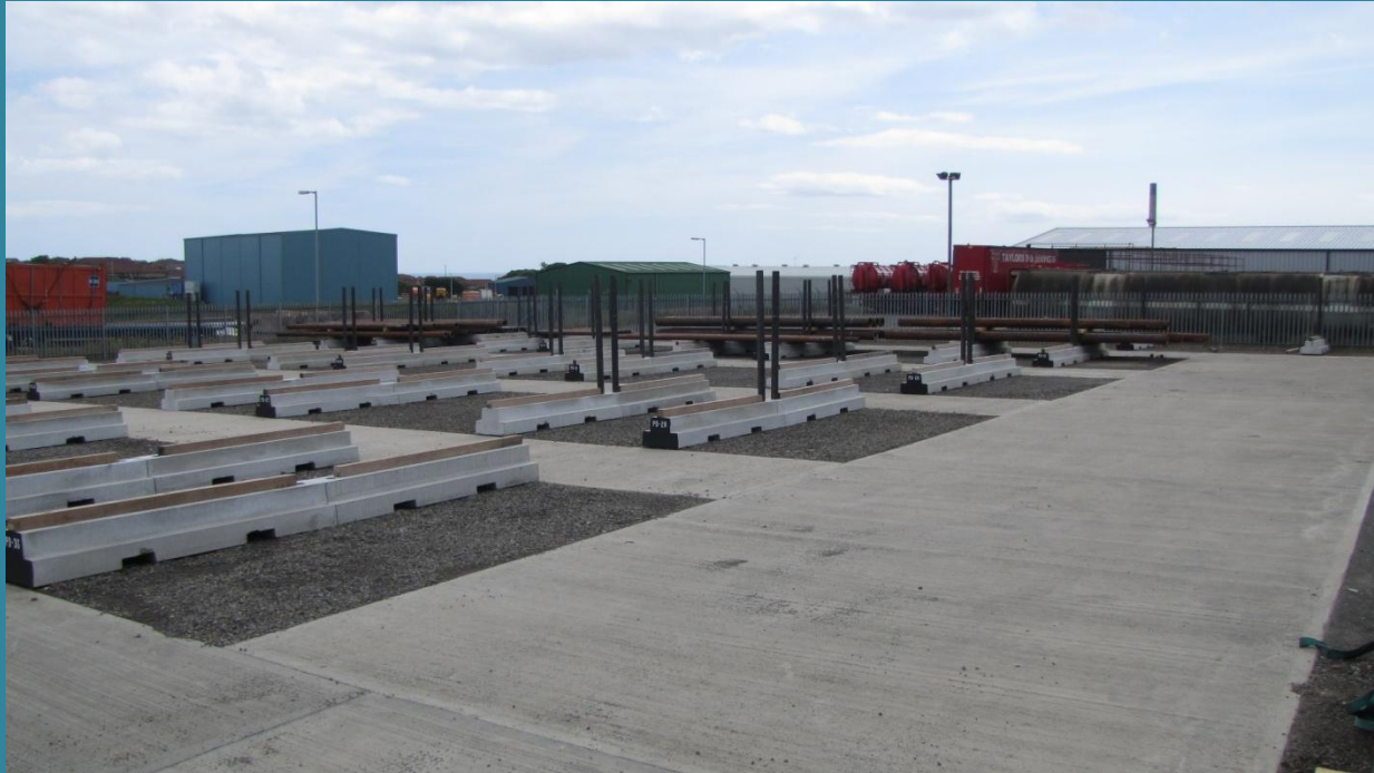
Roadway and bays in typical pipe yard

Concrete supports for storing and handling large oilfield or commercial pipes. These concrete supports have been designed to permit pipes to be stored in a controlled manner in a location where vehicles can access for delivery and collection. Pipes can be racked in a particular manner and can be unloaded and loaded by fork lift to minimise manual handling. Vertical supports can be placed in the racks to hold a certain number of pipes which can then be loaded directly to transport.