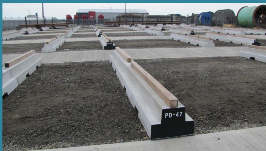
Racks showing ID. Marks

The racks are manufactured with recesses to fit forks for safe movement and placing. They can be manufactured to different sizes to meet the customer's needs. The photograph above shows they can be set out in different areas and configurations. The racks can be marked to identify particular pipe codes etc.