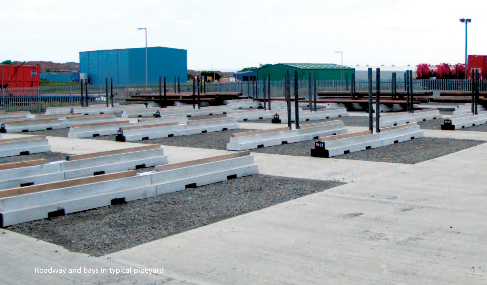
Roadway and bays in typical pipeyard

Concrete supports for storing and handling large oilfield or commercial pipes. These concrete supports have been designed to permit pipes to be stored in a controlled manner in a location where vehicles can access for delivery and collection. Pipes can be racked in a particular manner and can be unloaded and loaded by fork lift to minimise manual handling. Vertical supports can be placed in the racks to hold a certain number of pipes which can then be loaded directly to transport.