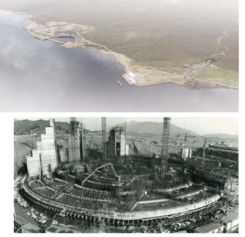
Kishorn from the air, and the Ninian Central Oil Platform under construction in the Kishorn Dry Dock in 1978.

PLANS TO REVIVE THE REDUNDANT FABRICATION YARD AT KISHORN IN WESTER ROSS ARE A STEP CLOSER TO REALITY THANKS TO KISHORN PORT LTD (KPL) A 50:50 JOINT VENTURE BETWEEN LEITHS AND FERGUSON TRANSPORT.