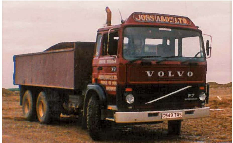
1986 Volvo F7

To make the vehicles more visible, we have added front and rear LED strobe lights, as well as LED beacons, rear mounted high visibility markings, and have revised the traditional livery to make it more prominent.