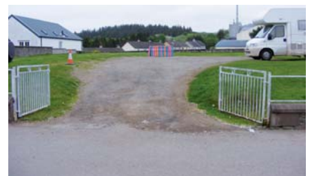
Before works commenced.