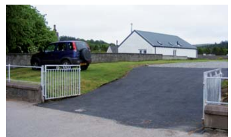
After works completed