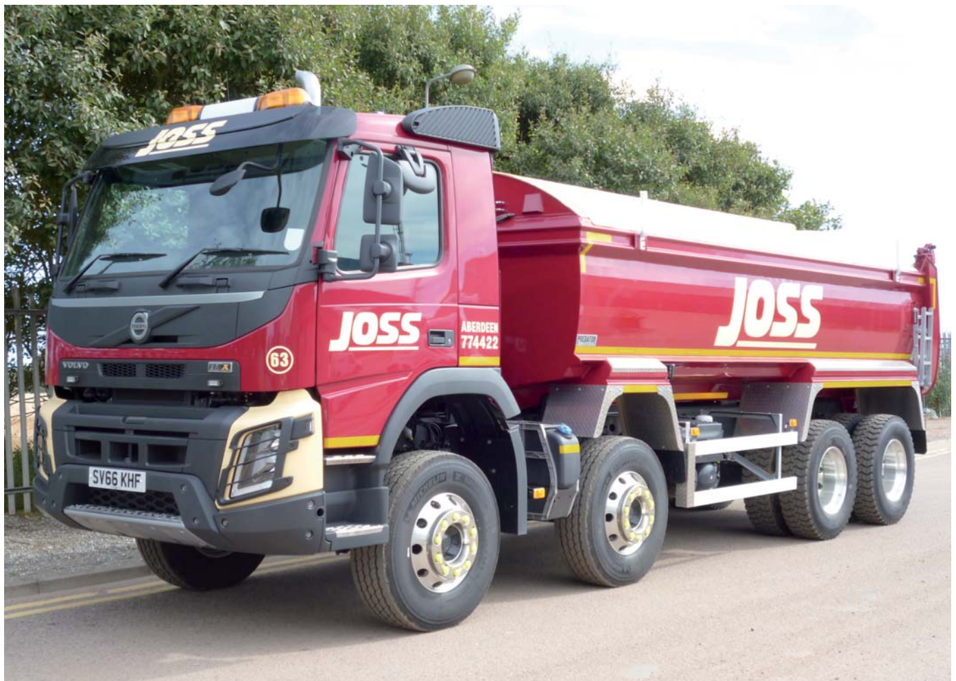
30 years on ... 2016 Volvo FMX